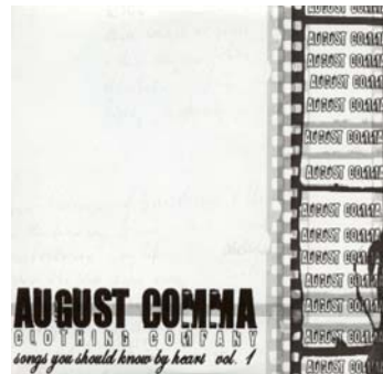
August Comma's Songs You Should Know By Heart

Kittykatdirtnap is currently in the studio recording their debut full length due out on Wonkavision records in May of 2004.