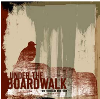
Utterpunk's Under The Boardwalk